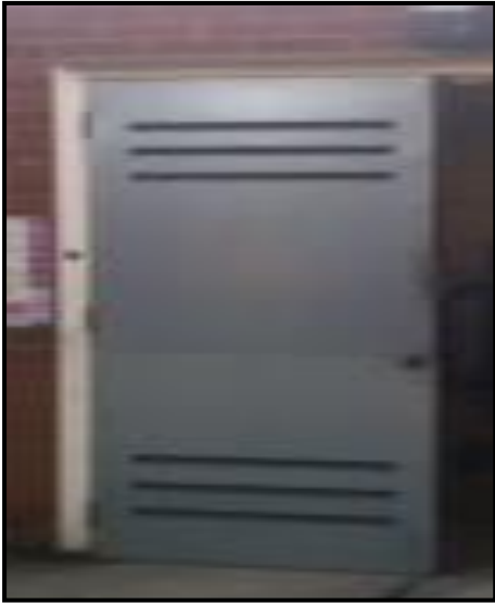
Figure 7: Another poor example of securing storage.