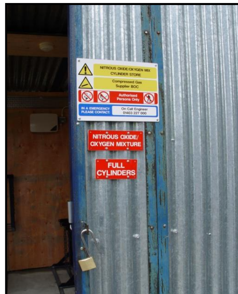
Figure 6: Poor example of securing a medical gas storage facility.