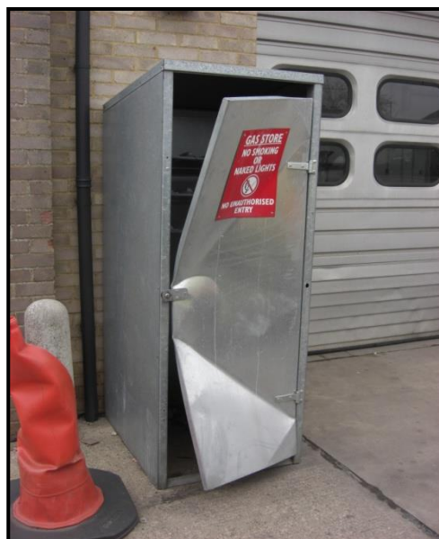
Figure 2: Example of poor storage which was exploited and cylinders stolen.