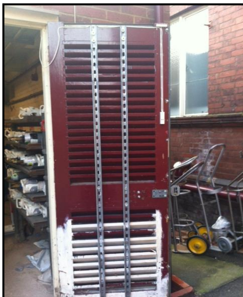
Figure 1: Metal bars have been placed to strengthen the door.