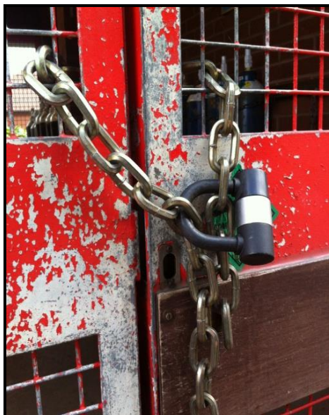
Figure 5: Steel-plated doors.